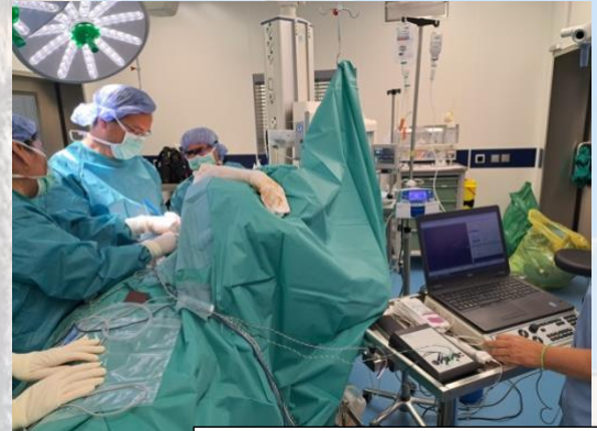
Doing nerve monitoring