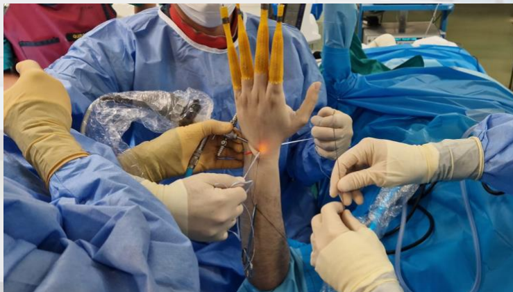
Performing an all-Arthroscopic 360° SL reconstruction

During my fellow I also had the chance to be invited to the Madrid Wrist Arthroscopy course which is a very high level masterclass course and to the Fessh Congress in Remini.