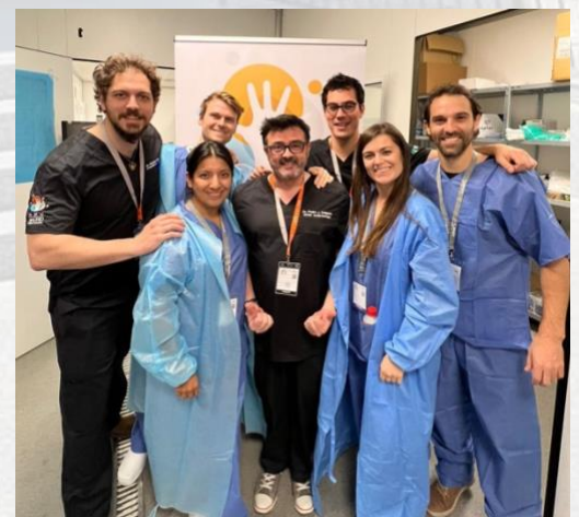
The Montepríncipe Team at the Madrid Wrist Course 2023

I would highly recommend anyone who is willing to learn more about wrist arthroscopy to visit him.