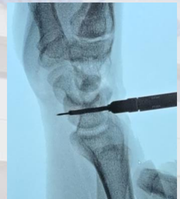
Lunate drilling during all-Arthroscopic 360° SL reconstruction