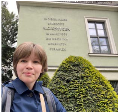
I saw a place, where W.C.Röntgen discovered x rays!