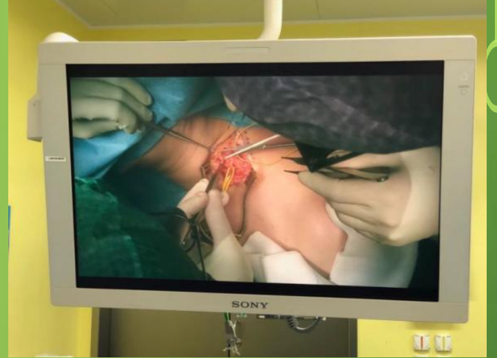
Brachial plexus tumor excision