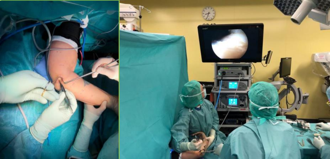
Cubital tunnel syndrome with arthroscopic ulnar nerve decompression