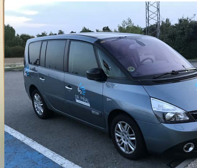
Transportation between Santander Madrid