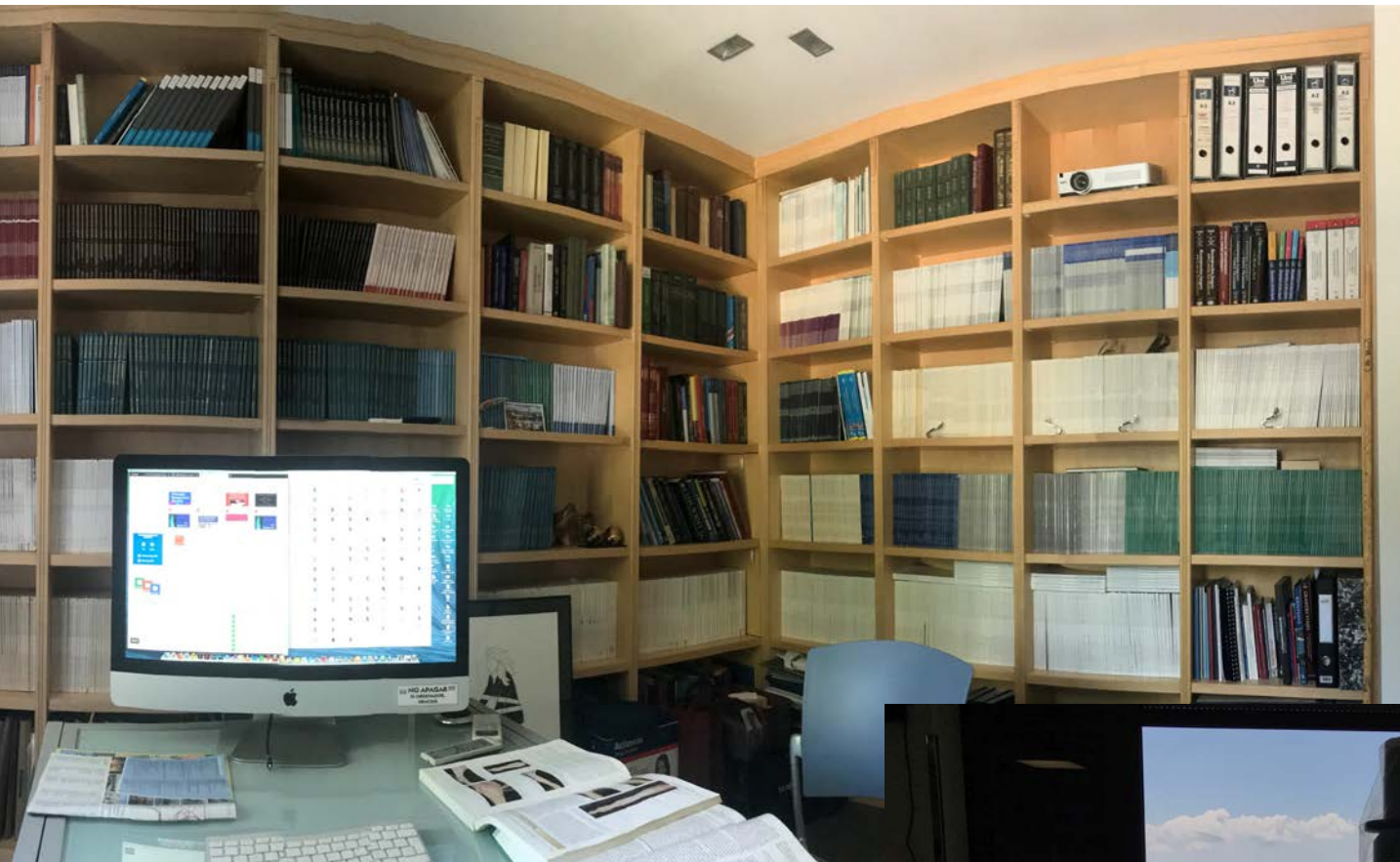
Library in the office