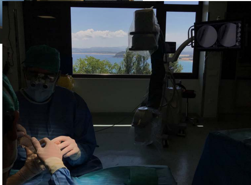
Surgery with view