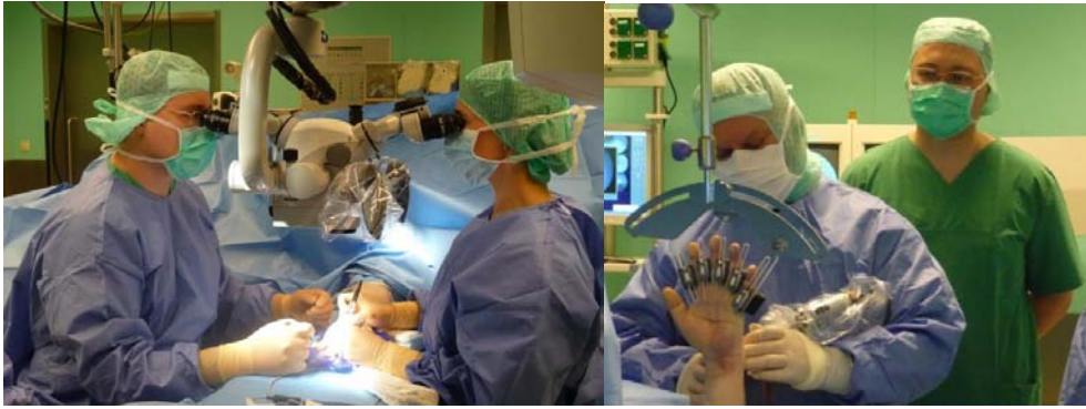
Daily work at the operation room.

I was in Schwerin in the spring season, but even in the middle of the spring we used to get almost 2 to 3 cases of distal radius fracture every day, different types of complex hand injuries. Elective cases like Dupuytren, Carpal Tunnel Syndrome were also very common. I was allowed to scrub in and assist in any of the cases. During my four weeks stay I assisted in about 120 hand surgery procedures.